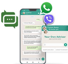
AGRIVI AI Engage Knowledge & Advice