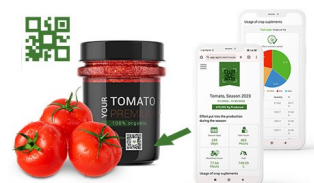
AGRIVI Food Traceability Food Safety & Transparency